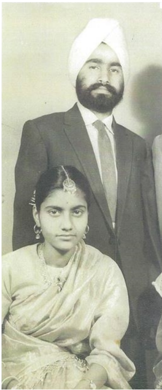
JANUARY 22, 1961