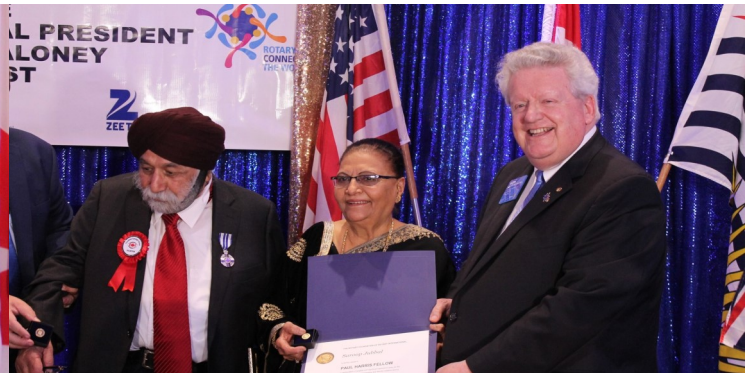
DISTINGUISHED SERVICE AWARD