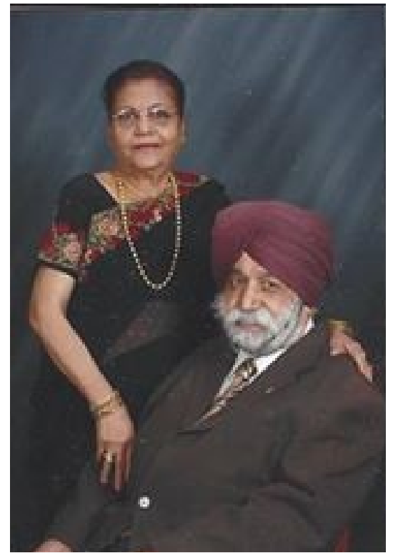
JANUARY 22, 2020.

Hope you find peace and fulfilment in each other and enjoy each day as a special day like never before.