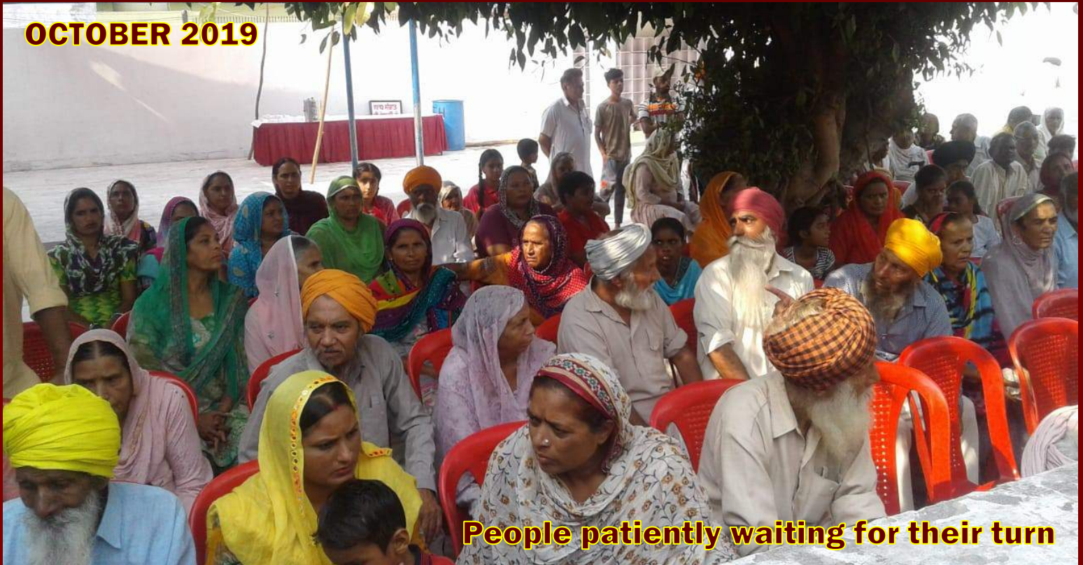
People patiently waiting for their turn